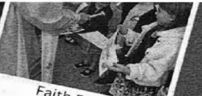
Faith Based Education