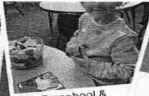
Preschool & Pre-Kindergarten